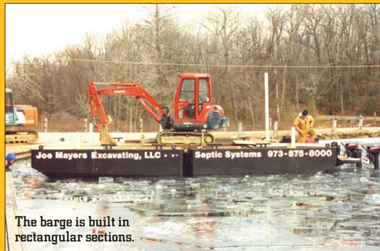
The barge is built in rectangular sections.