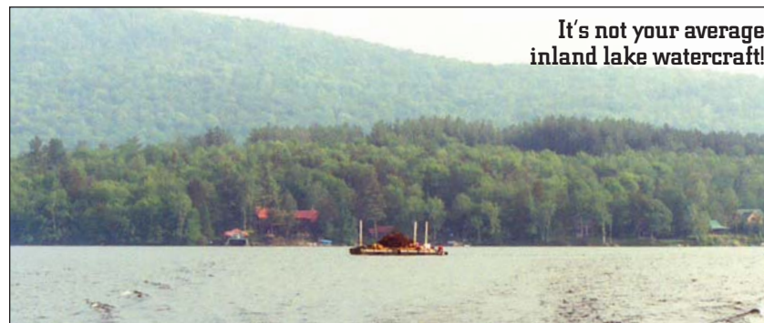
It's not your average inland lake watercraft!

Other local installers have been skeptical, waiting in the weeds to see how Joe succeeds with island systems. "They're waiting to see what happens to me," says Joe. "But it's been working out quite well. All I know is they can't believe we're doing this. It just doesn't look right when you're going out across the lake." ■