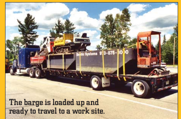
The barge is loaded up and ready to travel to a work site.

Fully loaded with 22 tons of equipment, the draft is 3 feet, and a foot of the barge is above water. Joe likes to load to about half capacity to transport sand or gravel. He moves one piece of equipment at a time, securing it to barge cleats. The barge deck has an anti-slip sand surface.