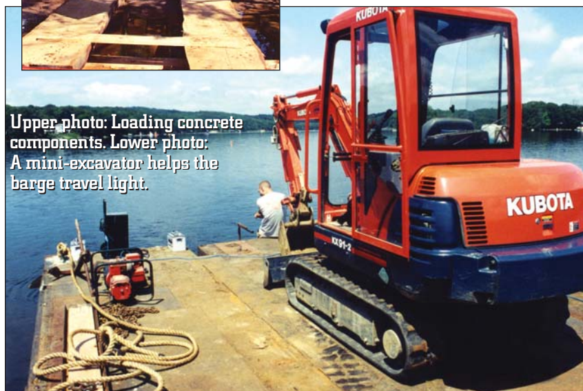
Upper photo: Loading concrete components. Lower photo: A mini-excavator helps the barge travel light.