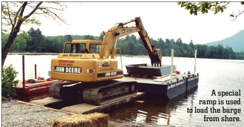
A special ramp is used to load the barge from shore.

ing a barge specifically to haul a 1,100-gallon vacuum tank and containment pan for septic system pumping.